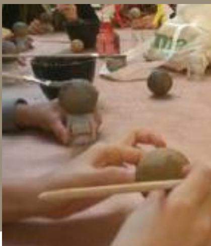
DORODANGO Glossy shining earth spheres